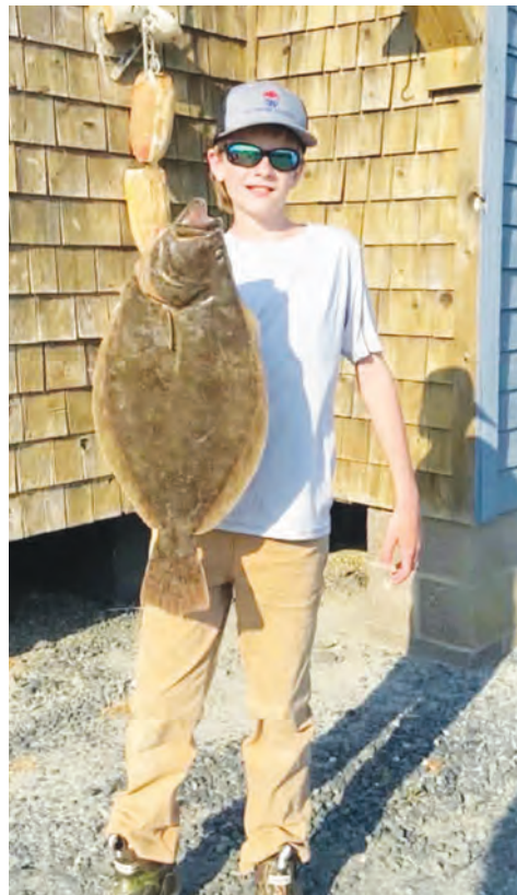
Winning in 2025 at the age of 11.