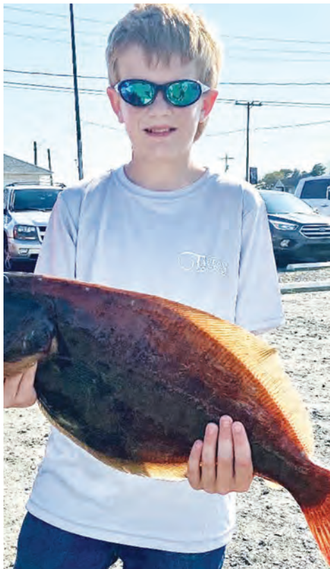
Winning in 2024 at the age of 10.