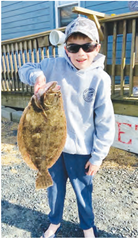
Winning in 2022 at the age of 8.