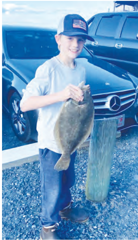
Winning in 2023 at the age of 9.