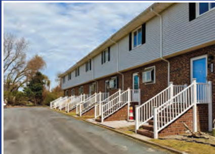
2 BR / 2.5 BA Townhouse Chincoteague, VA MLS# 71238 $390,000