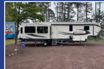
5th Wheel and Lot Horntown, VA MLS#71307 $94,500