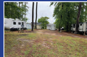
Cleared Lot with Septic Horntown, VA MLS# 71508 $49,900