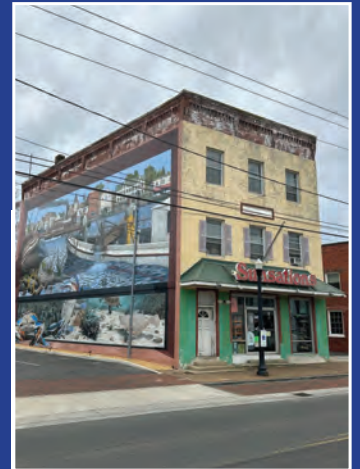
BUSINESS OPPORTUNITY 6,120 sq ft space Chincoteague, VA MLS# 66709 $499,000