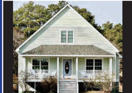
6 BR / 2 BA Beach House Chincoteague, VA MLS# 65674 $799,000