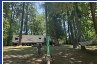
Two Lots Side by Side Horntown, VA MLS# 71591 $70,000