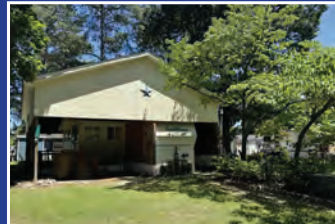
Two Lots with Septic Horntown, VA MLS# 71564 $79,900