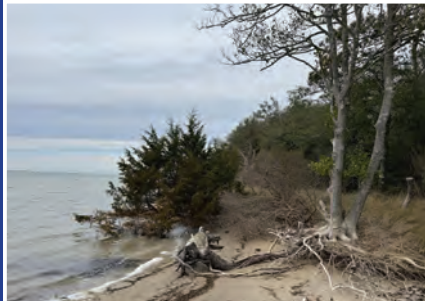
Waterfront Lot Painter, VA MLS# 71017 $149,900