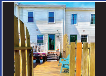
2 BR / 1.5 BA Townhouse Chincoteague, VA MLS#67903 $270,000