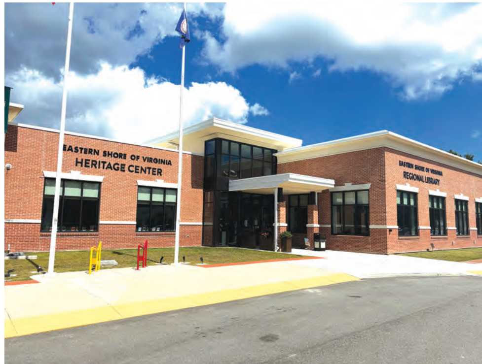
SHORE FIRST/TED SHOCKLEY

Once you located the proper volume, you were then faced with