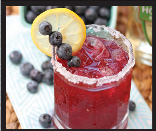
Blueberry margaritas a summer hit | Page 8

Pony month comes to Chincoteague 101st annual Pony Penning will be another classic event | Page 4