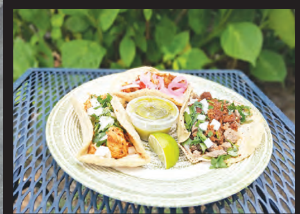
Carmelita's is popular in Cheriton | Page 6